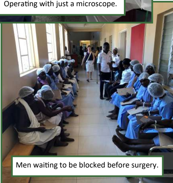
Men waiting to be blocked before surgery.