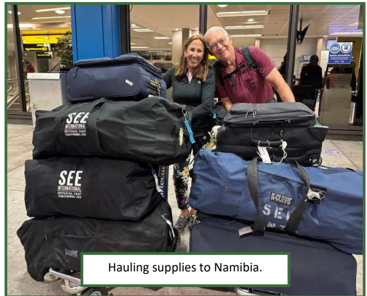
Hauling supplies to Namibia.