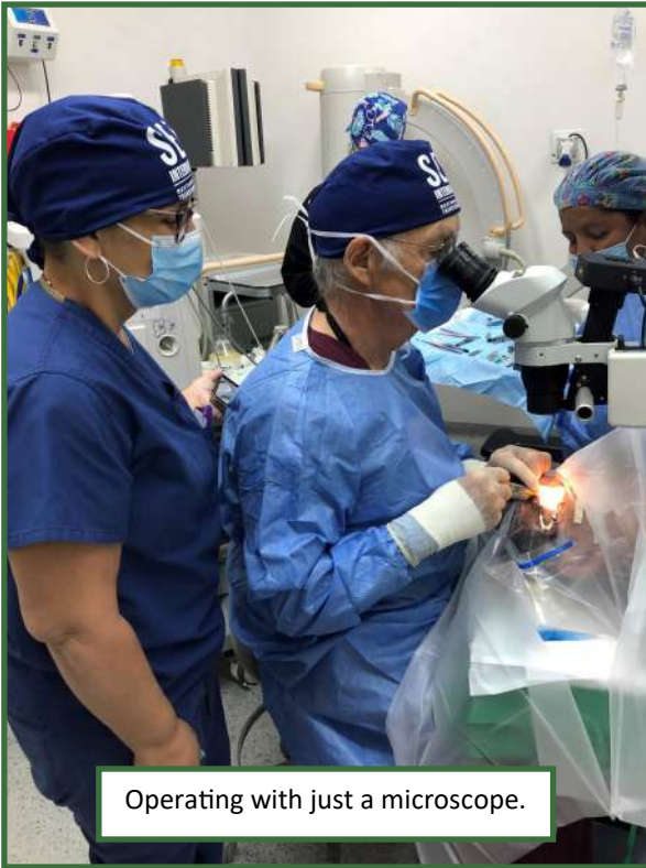
Operating with just a microscope.