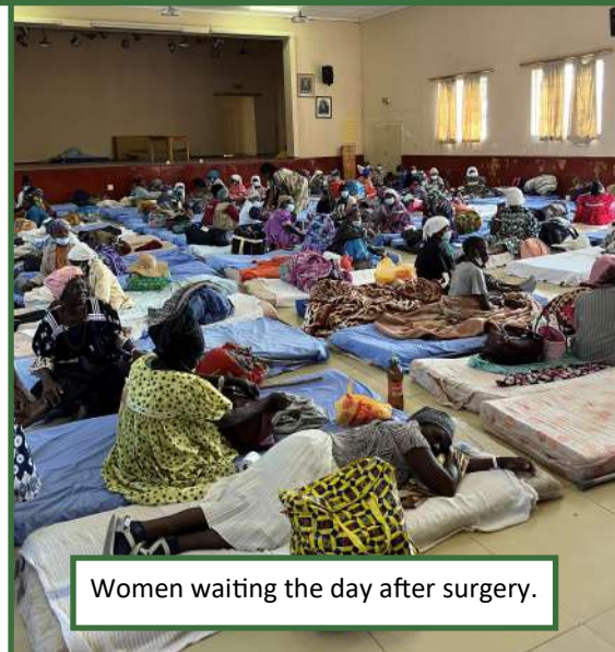
Women waiting the day after surgery.